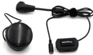
ControlSwitch with Buddy Button